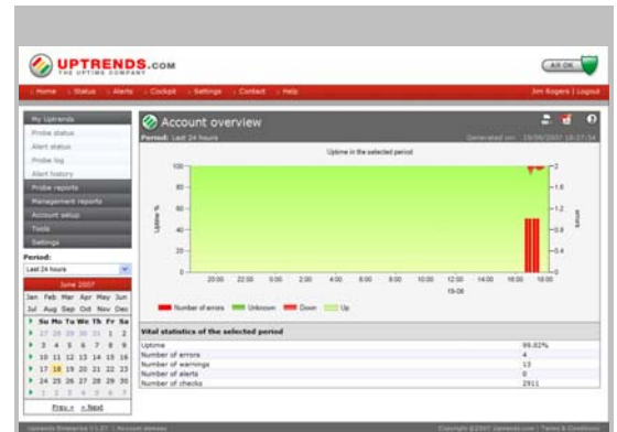
Interactive and detailed reports

Uptrends professional is available for $22.62, £11.51 or €16.95 per month. Uptrends Enterprise is available for $31.97, £16.27 or €23.95 per month. Customer support, updates and 20 SMS / text messages are included. You can easily add more SMS / text messages or probes to your account for a small fee. For more pricing details please visit our website www.uptrends.com